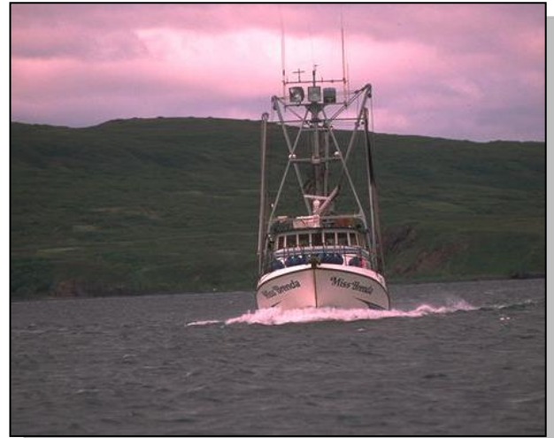
Rep. Bryce Edgmon encourages fishermen across District 37 to look into the new commercial fishing engine efficiency loan program.

Loan terms are 2% below the prime lending rate, with a "floor" of 3 % when the prime rate is at 5% or less. Loans can be made for both propulsion engines and generator sets. Loan amounts can include installation costs.