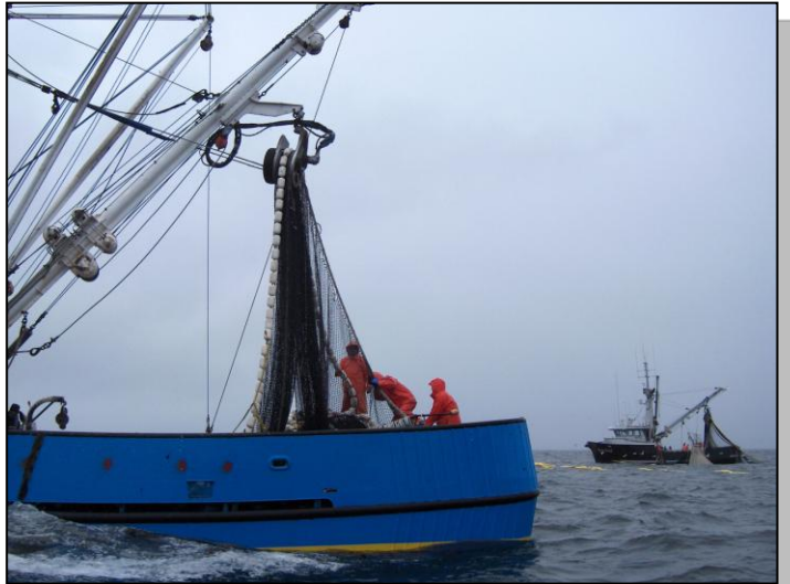
NOAA's Alaska Fisheries Science Center is gathering information from coastal communities to update the North Pacific Fisheries Community Profiles. A teleconference is scheduled for 10 a.m. on Sept. 30, 2010 to summarize the

http://www.afsc.noaa.gov/REFM/Socioeconomics/Projects/CPU.php