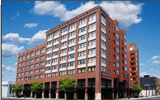
The AEB Fishermen's Meeting in Seattle is scheduled for 10 a.m. on Nov. 18, 2010 at the Silver Cloud Inn.

The Borough is gearing up for a fishermen's meeting at the Silver Cloud Inn in Seattle, scheduled for 10 a.m. on Nov. 18, 2010. The hotel is located across the street from the Qwest Field Event Center. Topics at the fishermen's meeting are expected to include a recap of the fishing season, the new observer program, additional sampling in the SEDM, the SSL BiOp and cooperative research projects.