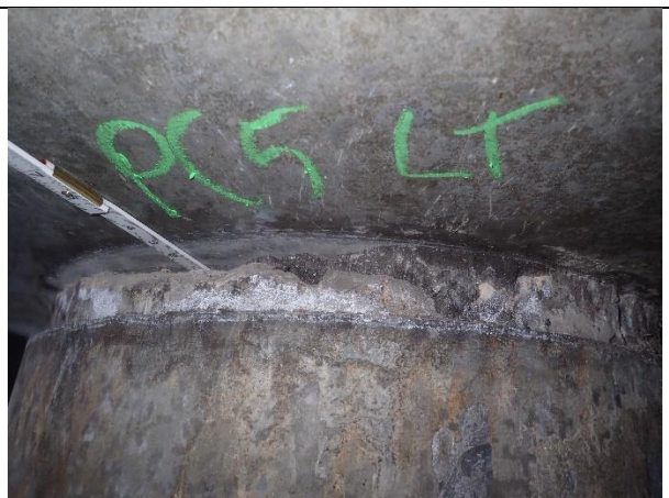
Pile to Pile Cap Interface Spalling