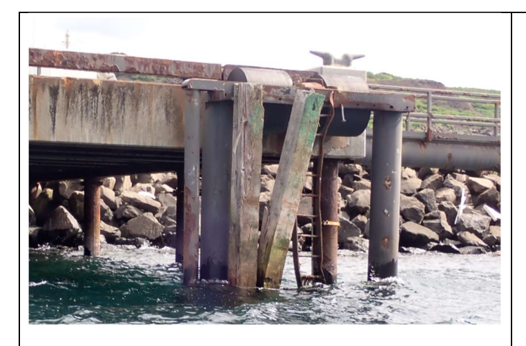
Southern-most fender panel, consider the "lead-in" based on damage. Labelled #1. Impact damage to support piles, only 1 of 8 original fender timbers intact.