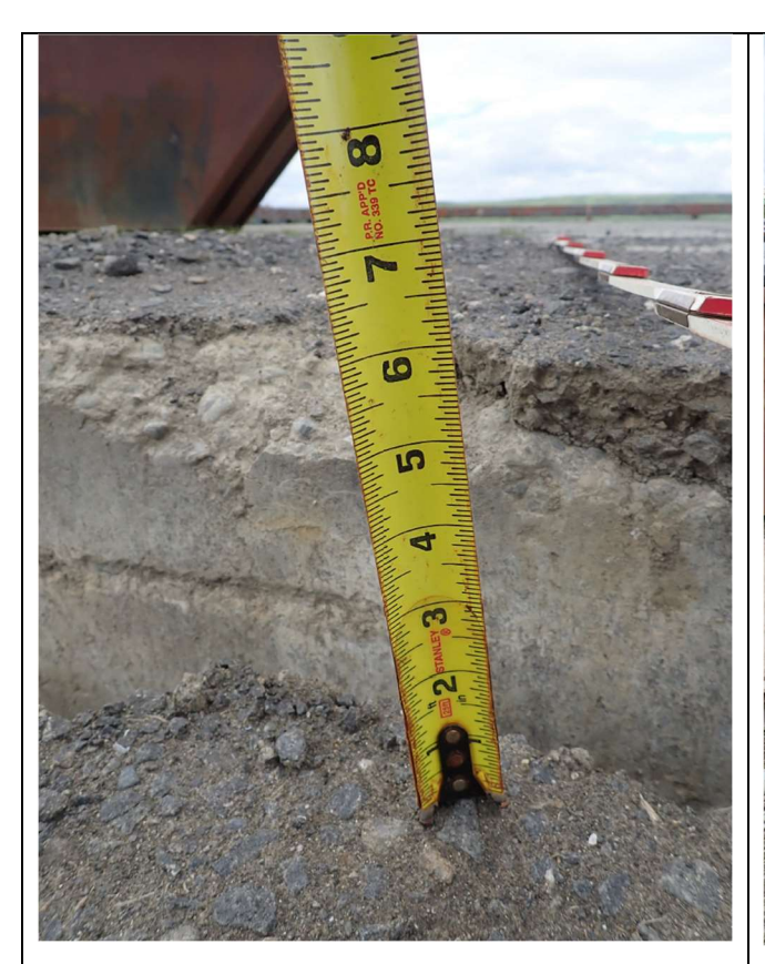
Settlement varies at the Old Dock ~7-8 inches