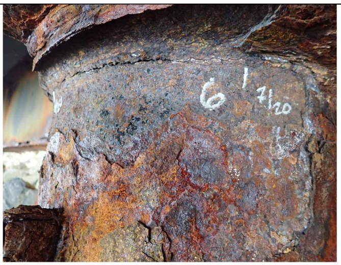
Crack in shoreward-most pier, Pile #6. Approx. 16-inches long on seaward side of pile, below pile-pier cap welded connection.