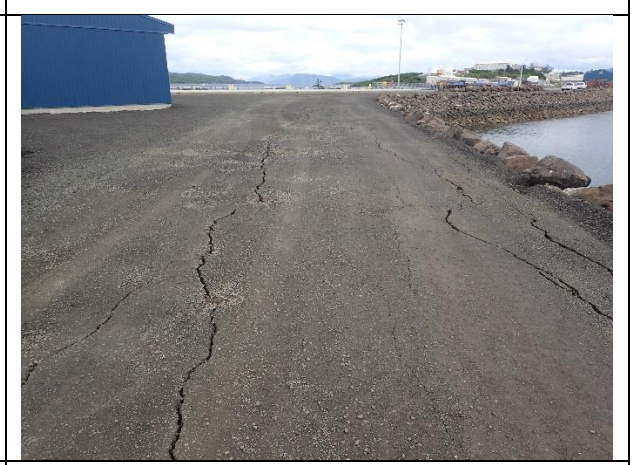
Cracks in Roadway on Breakwater