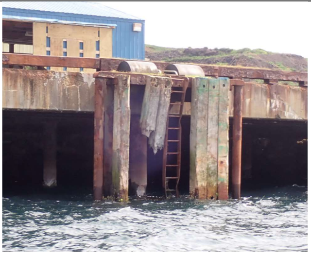
Fender panel #5 is typical, 4 of 8 fender timbers remain. Steel connection brackets exhibit heavy corrosion and impact damage.