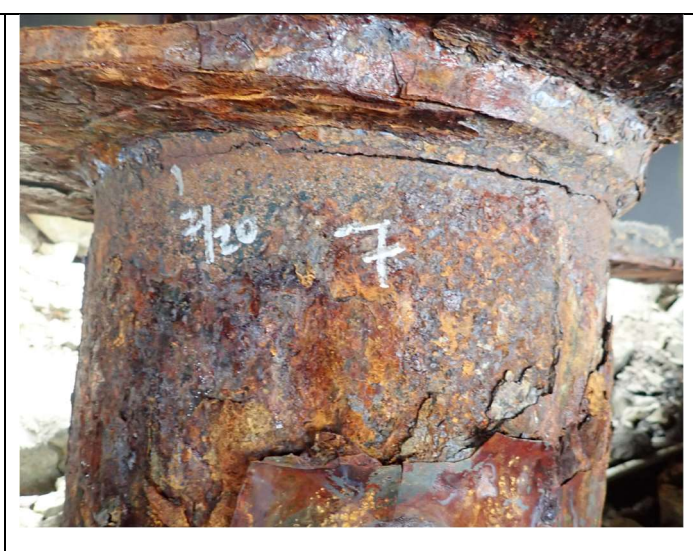
Crack in shoreward-most pier, Pile #7. Approx. 13-inches long on seaward side of pile, below pile-pier cap welded connection.