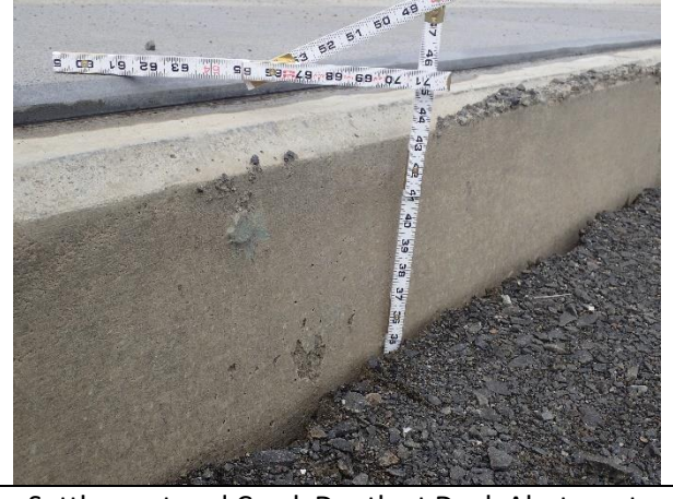
Settlement and Crack Depth at Dock Abutment, Typical