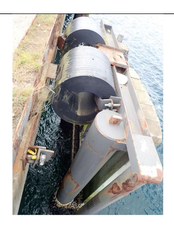
Fender panel #4 is not attached to the dock, and the entire panel is displaced ~33-inches to the south.