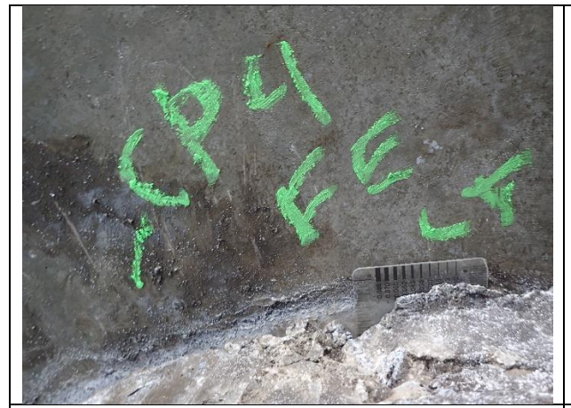
Pile to Pile Cap Interface Crack Penetration, Typical