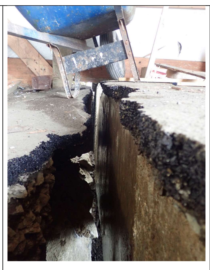
Close-up of settlement and soil failure in Storage Building

001 - 40" deep trench/soil failure in approach road at abut. pier cap