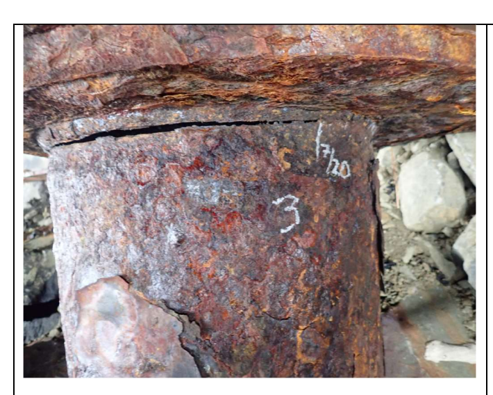
Crack in shoreward-most pier, Pile #3. Approx. 19inches long on seaward side of pile, below pile-pier cap welded connection.