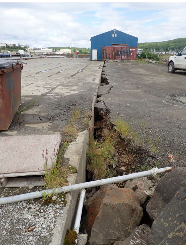
Looking north along soil failure at dock/road interface